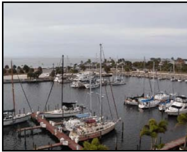
View of marina