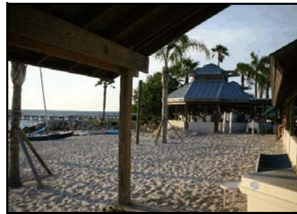
Beach outside restaurant